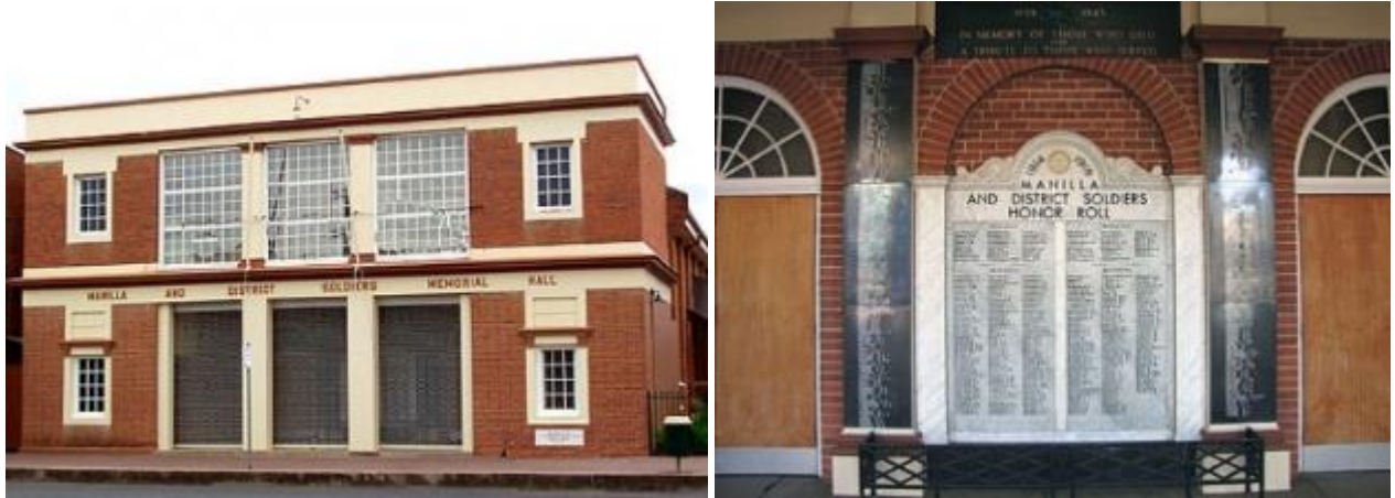
Manilla and District Soldiers Memorial Hall